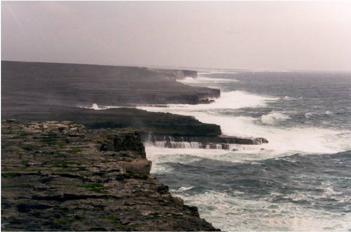
View of the Inishmore coastline, Aran Islands